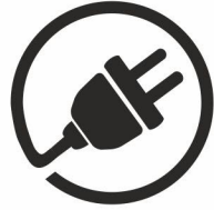
Power Backup (Common Area)