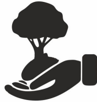
Pollution Free Environment