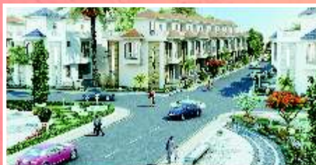
Park Villa (66-Villas) Kamla Nahru Nagar, Ajmer Road, Jaipur