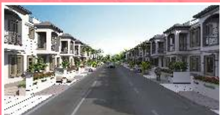
Prime Villa (80-Villas) Mahapura, Ajmer Road, Jaipur